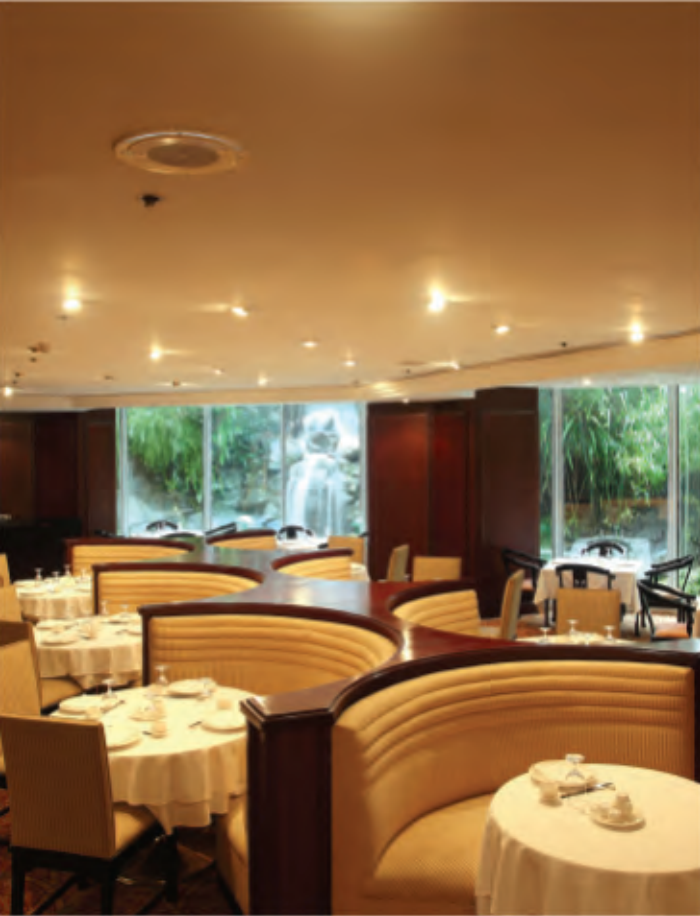
The Great Wall