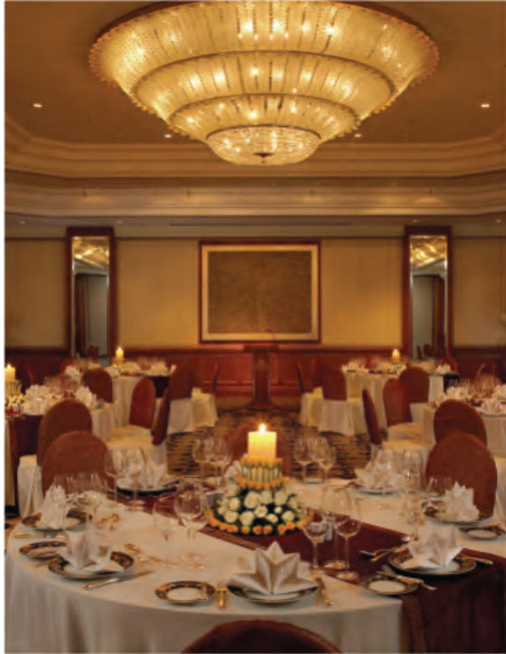
The Grand Ballroom