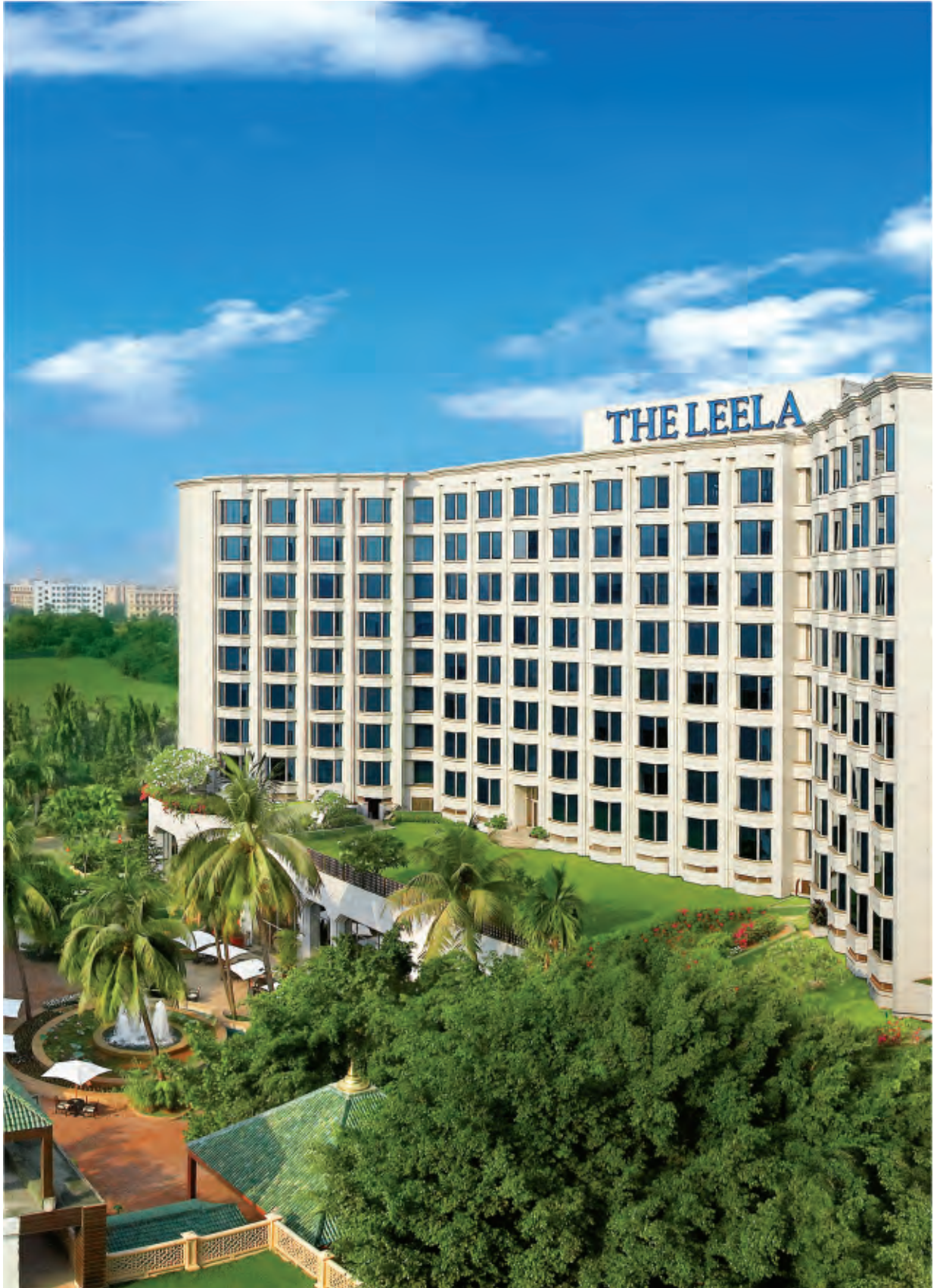
The Leela Mumbai